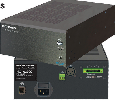
NQ-A2300 Audio Power Amplifier (300W 2-CH model)