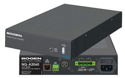
NQ-A2060, NQ-2120 Audio Power Amplifiers (60W & 120W 2-CH models)