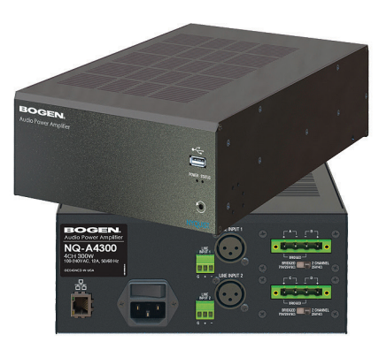
NQ-A4060, NQ-A4120, NQ-A4300 Audio Power Amplifiers (60W,120W, & 300W 4-CH models)