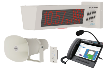
11.0 Software supports new Nyquist IP-Peripherals