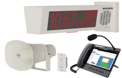
11.0 Software supports 4 new Nyquist IP-Peripherals