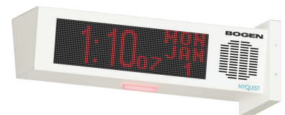
NQ-DSC01 - Nyquist VoIP Double-Sided LED Message Display & Flasher