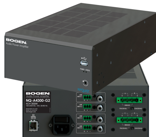
Model NQ-A4300-G2 shown