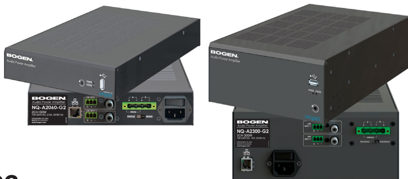
Models NQ-A2060-G2 & NQ-A2300-G2 shown