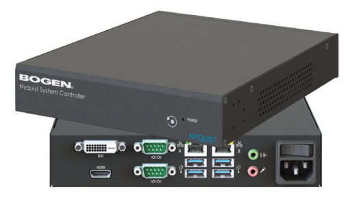
NQ-SYSCTRL - NYQUIST System Controller