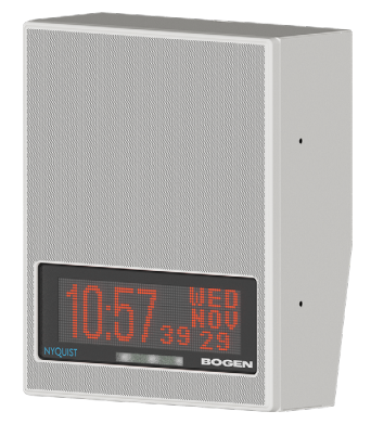
NQ-S1810WBC - Nyquist VoIP Wall Baffle Combo Speaker