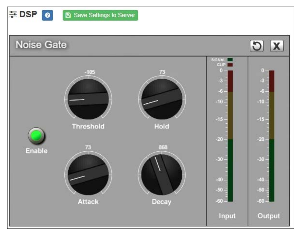
Figure 15. Noise Gate Settings

To adjust the noise gate settings for a channel: