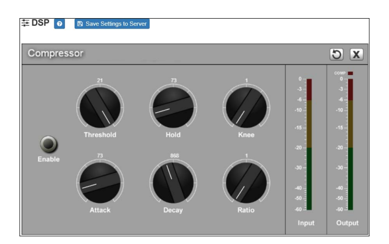
Figure 10. Compressor Settings

A compressor reduces the dynamic range of a signal. This effect is perceived as quieting loud sounds and boosting quiet sounds.