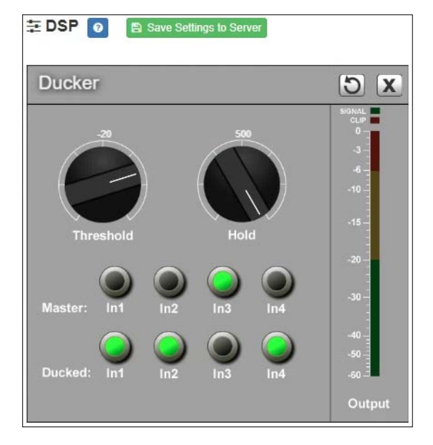
Figure 11. Ducker Parameters

To adjust the ducker settings for a channel: