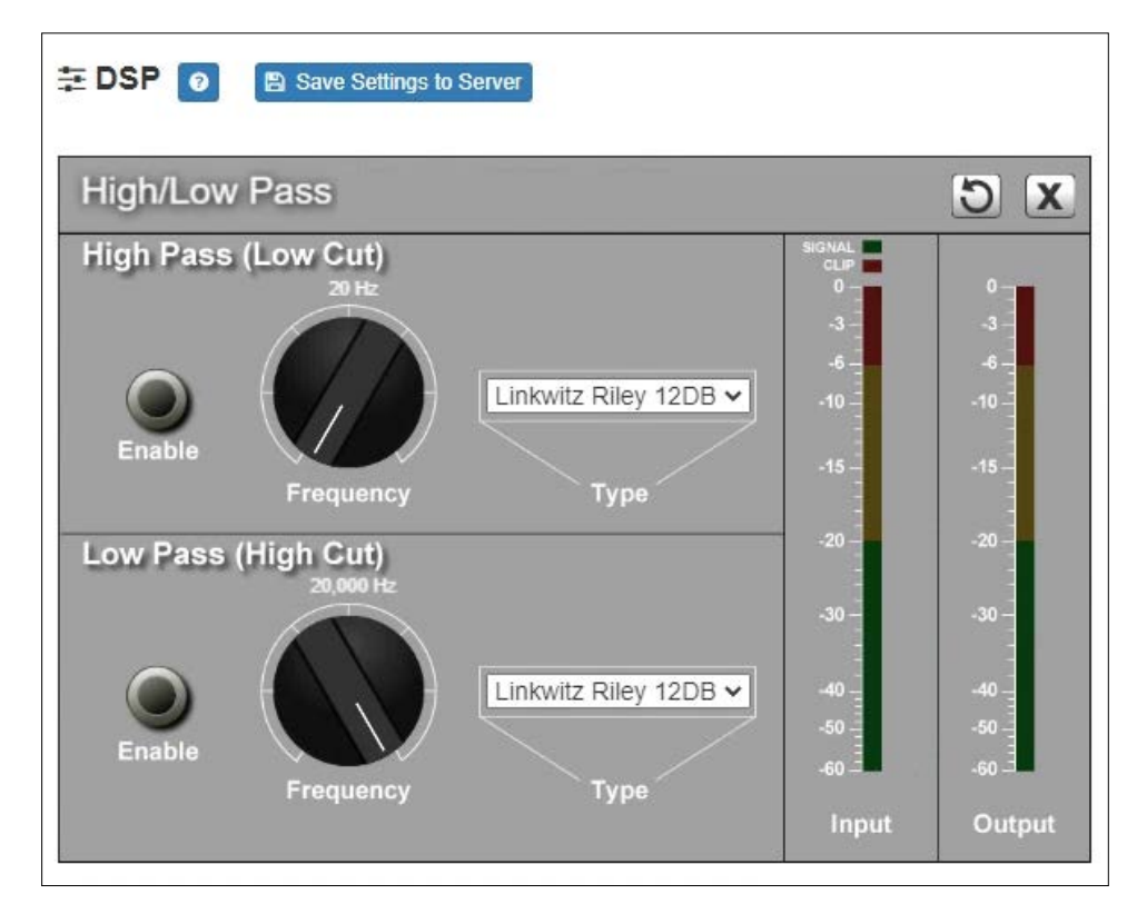
Figure 13. High/Low Pass Parameters

You can specify the range of frequencies that will pass through the high-pass and low-pass filters and select the type of filter that is used through the channel's High/Low Pass drop-down menu option.