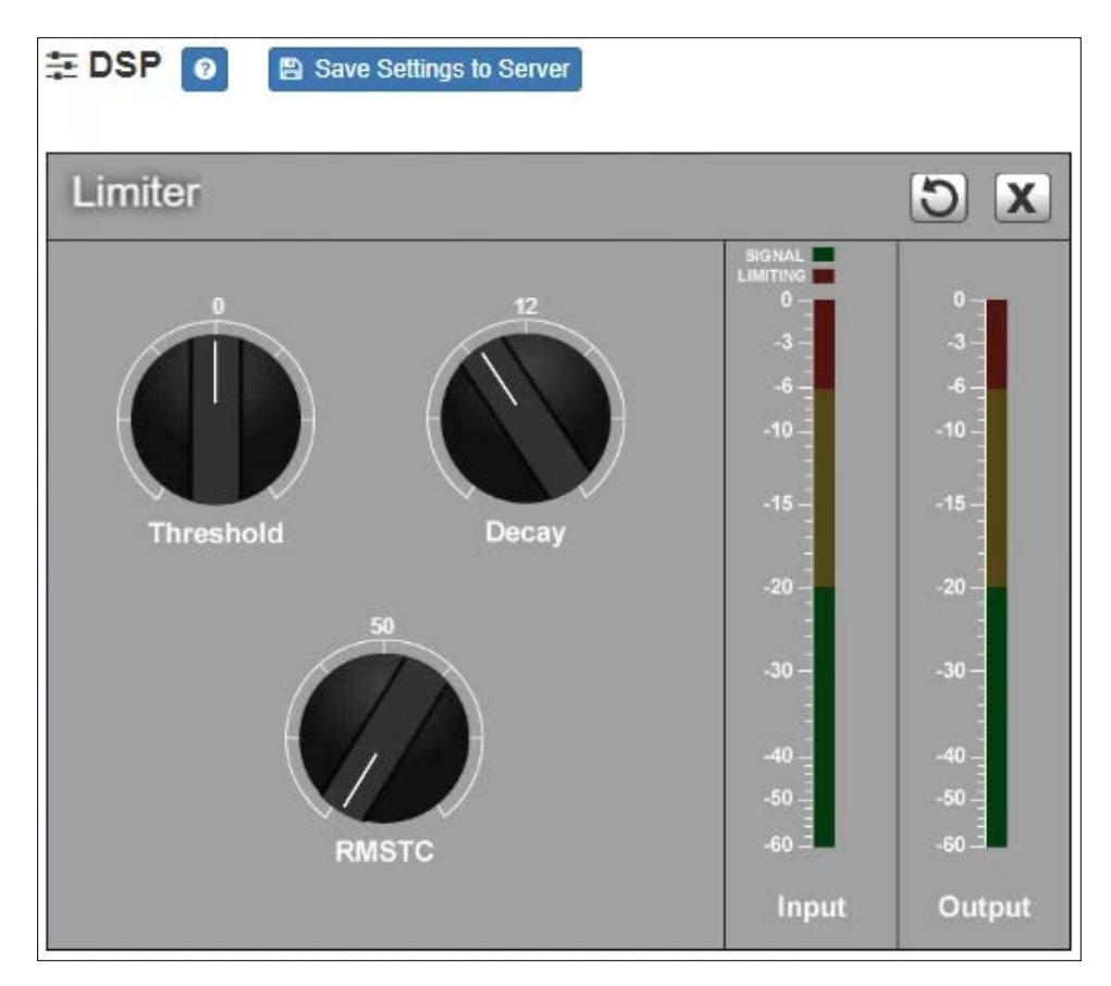
Figure 14. Limiter Settings

To adjust the limiter settings for a channel: