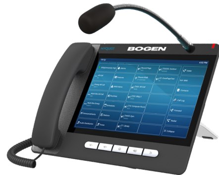
NQ-ZPMS Admin Phone