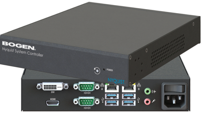
NQ-SYSCTRL - NYQUIST System Controller