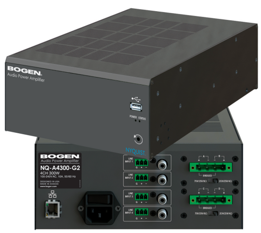
Model NQ-A4300-G2 shown