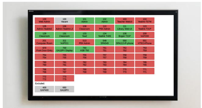
NQ-GA10PV displaying classroom Check-in progress

To download the Ver. 7.0 Release Notes and view all the details, visit: http://www.bogenedu.com/secure-login/