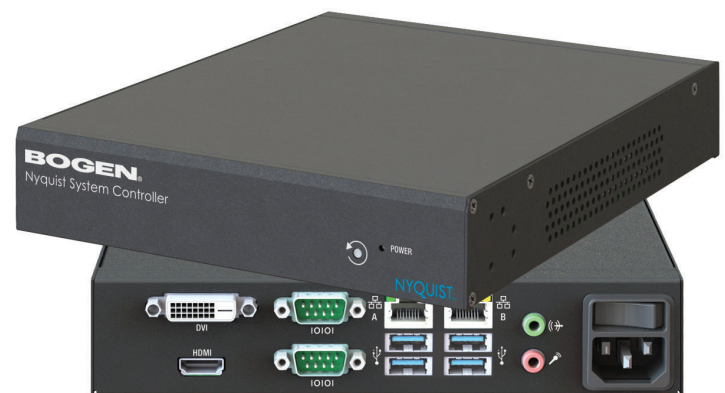
NQ-SYSCTRL - NYQUIST System Controller