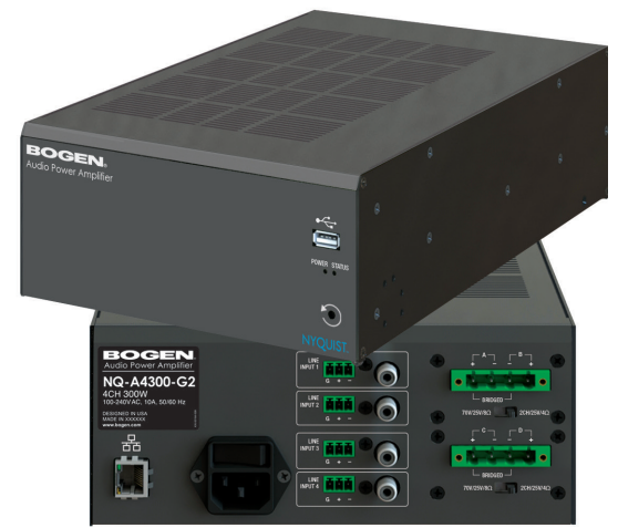
Model NQ-A4300-G2 shown