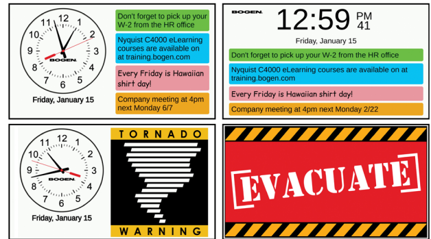
Clock/Messaging Display capability improves facility communications