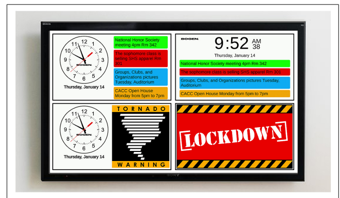
Clock/Messaging Display capability improves school communications