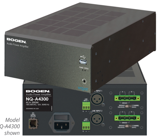
Model NQ-A4300 shown

The Nyquist NQ-A4xxx are now capable of Standalone Operation that allows for use of these appliances for AoIP applications such as a SIP endpoint to act as a paging mixer/amplifier for an existing iPBX/VoIP phone system, or a paging mixer/amplifier on an existing PBX/analog phone system; additionally allows the NQ-A4xxx audio power amplifiers to be used in standalone audio applications where a networked amplifier is desired for remote volume, mixing and DSP control from a web browser-enabled device.