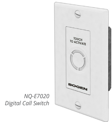
NQ-E7020 Digital Call Switch