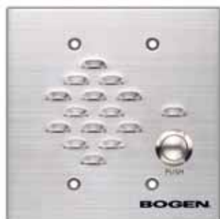
Shown without bezel frame