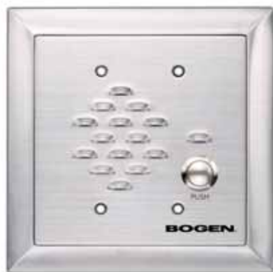
Shown with bezel frame (Included)