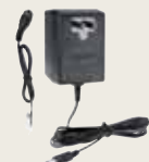
PRS2403 24V DC Power Supply