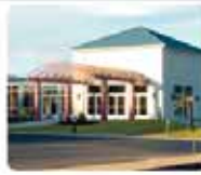
CONVENTION CENTERS Carlisle Exposition Center Carlisle, PA