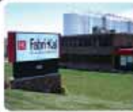
MANUFACTURING Fabri-Kal Plastic Manufacturer Hazleton, PA