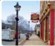
OUTDOOR INSTALLATION Historic Newaygo Downtown Newaygo, MI