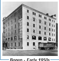
Bogen - Early 1950s

Founded in 1932, Bogen's dedication to providing superior sound reinforcement products has won the continued loyalty of an ever-increasing network of distributors, dealers, contractors, and installers worldwide.