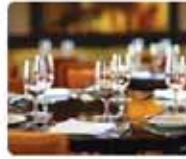
RESTAURANTS Fanatico Italian Bistro Restaurant Jericho, NY