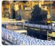
FACTORIES Crown Beverage Packaging Division Lawrence, MA