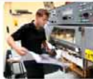
PRINTING PLANTS Color Graphics Printers Costa Mesa, CA