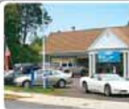
AUTO DEALERSHIPS Stockburger Chevrolet/Chrysler Newtown, PA