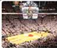
INDOOR ARENAS American Airlines Arena Miami, FL