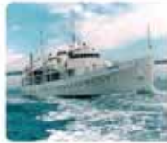
MUSEUMS U.S.S. Potomac Presidential Yacht Docked in Oakland, CA