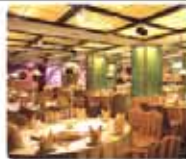
BANQUET HALLS Le Mirage Loft at "New York, NY" Taipei, Taiwan