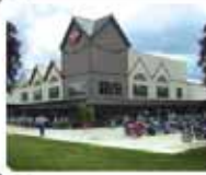
MOTORCYCLE DEALERSHIP Harley-Davidson of Jamestown Falconer, NY