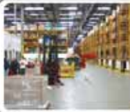
DISTRIBUTION CENTERS ACE Hardware Regional Warehouse Gainesville, GA

Bogen products have been used in numerous types of applications, each with its own unique requirements. Whether simple or sophisticated, installations around the world benefit from Bogen, Apogee, and NEAR® brand products. Here is a small sampling of case studies showing venues where our systems have been installed. Read more about each of these and more online at: www.bogen.com/applications/casestudies