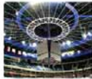
STADIUMS & ARENAS Sazka Arena Prague, Czech Republic