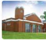
FIRE STATIONS North Royalton Fire Department North Royalton, OH