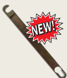
HSES10 Horn Speaker Electrical Strap (Not for SP58A & SPT5A)