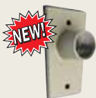
TCSPT1 Terminal Cover for Conduit (For BDT30A, KFLDS30T, SP158A, SP308A, SPT15A, & SPT30A)