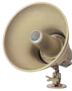
SPT15A, SP158A, SPT30A+, SP308A+